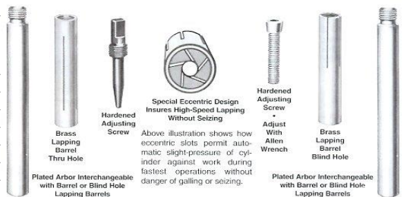
Brass Lapping Barrel Thru Hole